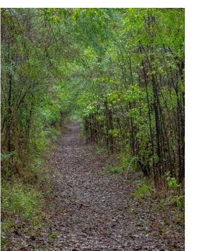
Corridor maintenance on the south coast involves significant pruning work to cope with dense and rapid regrowth.